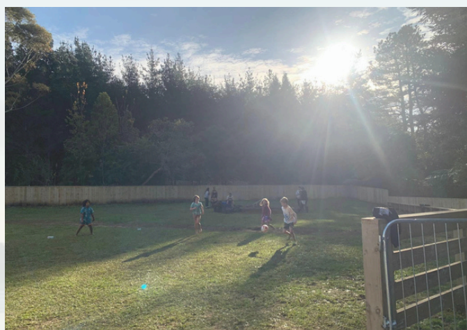
Photo: Children play on the reserve at our Matariki Celebration

To all the helpers, hangi masters, prep team, servers, dish washers and cleaners your hard work didn't go unnoticed. We are deeply grateful for your kindness and commitment and enthusiastically look forward to the next one. Thanks for making the first Opoutere community Matariki hangi a great success!