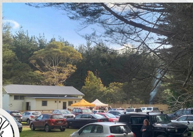
Photo: A good turn out for our 2024 Matariki Celebration

To all the helpers, hangi masters, prep team, servers, dish washers and cleaners your hard work didn't go unnoticed. We are deeply grateful for your kindness and commitment and enthusiastically look forward to the next one. Thanks for making the first Opoutere community Matariki hangi a great success!